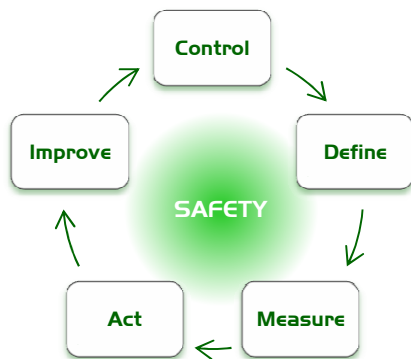
Risk assesment process flow