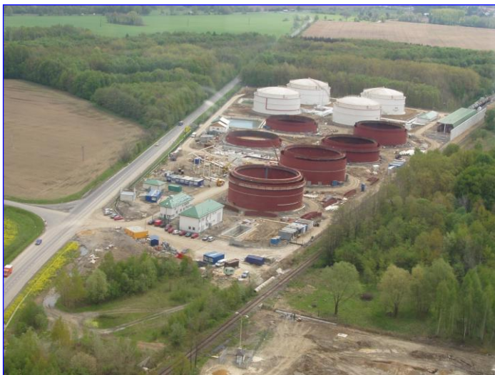
Construction in progress

Project details: ..... .The Sedlnice tankfarm is the newest and the most modern storage