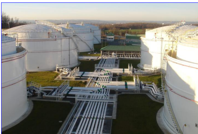
Tanks and pipes

facility owned by fuel logistic operator, the company ČEPRO. It consists of 10 tanks with total capacity 100.000 m 3 , railway and tank truck terminals. Sedlnice is located 20 km from Ostrava, the third biggest town in the Czech Republic and the biggest industrial centre.