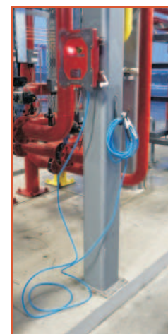
EGT4 with straight sensing cable

SOLUTIONS FOR OIL & GAS AND WATER INDUSTRY