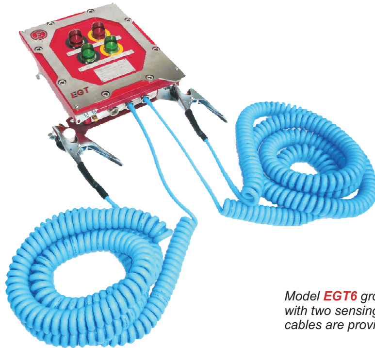
Model EGT6 grounding monitor with two sensing lines. Coiled cables are provided optionally.

Optionally we can provide sensing cable with extended length upto 20 m, coiled cable, or cable reel.