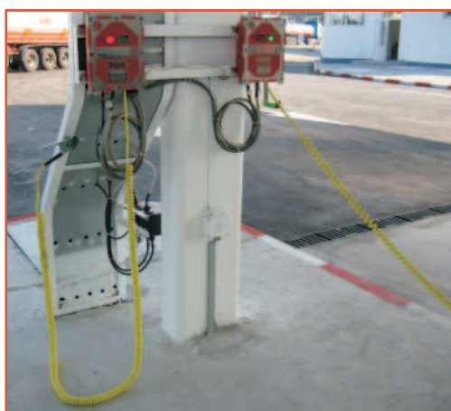
Two of EGT4 with coiled sensing cables

The equipment uses a combined measuring principle to verify the grounding state, and is very resistant against the incorrect usage as shown on the second diagram. If the clamps are short-circuit to the ground, EGT recognizes this as wrong grounding. This pushes the operators to pay necessary attention to correct grounding of each tanker, and increases operating safety (this feature is available only by trucks - not by the railway cars).